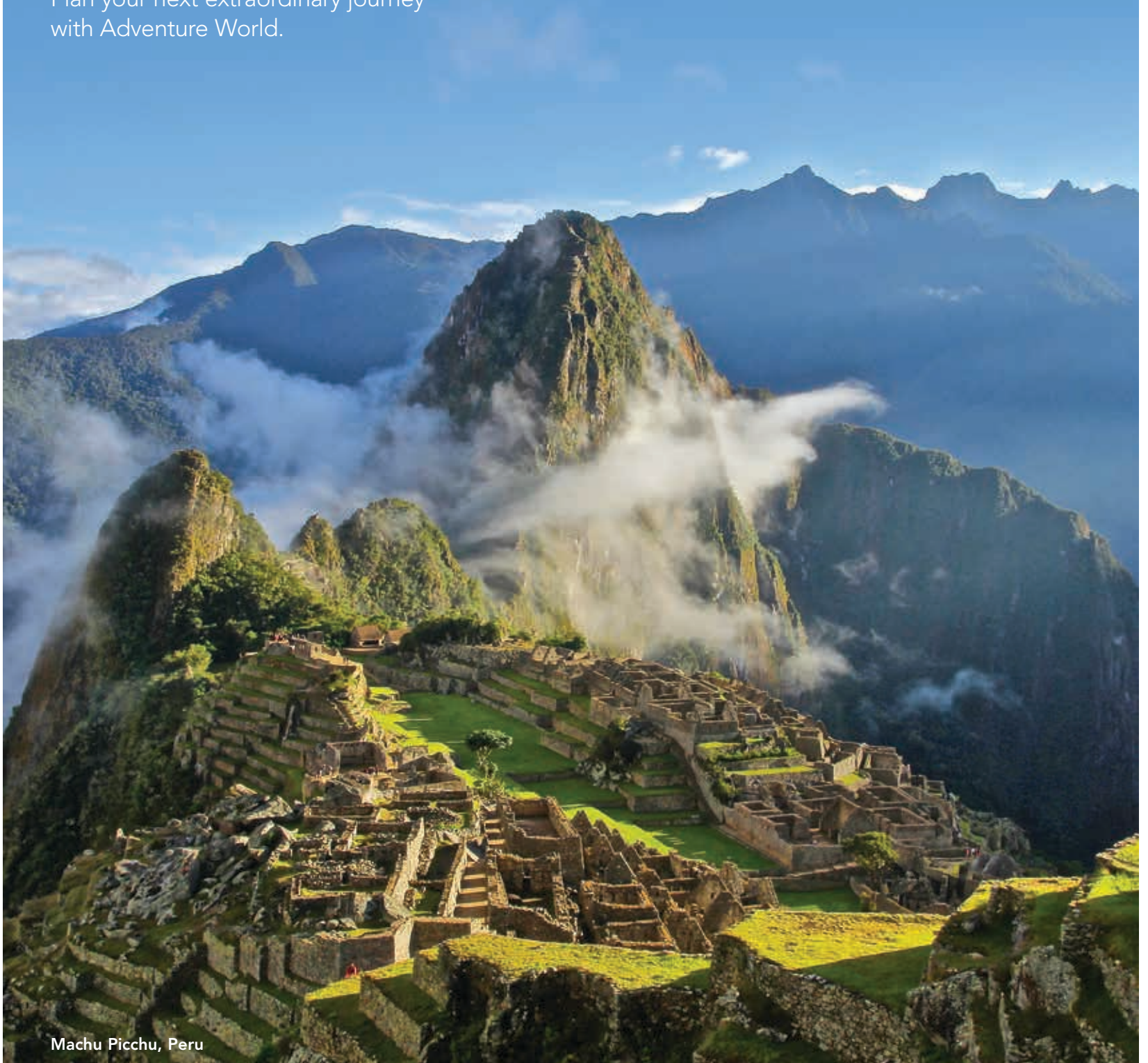
Machu Picchu, Peru

Experience the wonders of some of the continents coolest cities, wander the colourful neighbourhoods, explore wondrous jungles which teem with wildlife, discover white sand beaches and immerse yourself in the history of ancient civilisations.